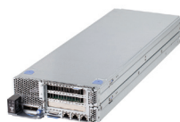
IBM NeXtScale nx360 M4